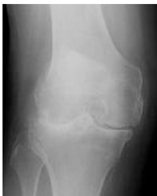
BEFORE Advanced Knee Arthritis

An incision is made on the front of the knee. The damaged bone is cleared away. The surfaces are prepped and shaped to hold the new components. The new components are aligned and secured to the thigh bone and shin bone.