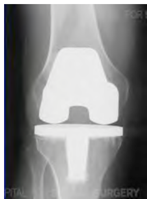
AFTER Following Total Knee Arthroplasty